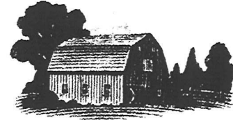
Dry Litter Poultry Facility

Concentrated Sources of Potential Contamination livestock or poultry yards, cemeteries, pesticide facilities, etc]